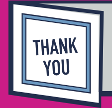
organize thank yous