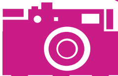
photography & upload