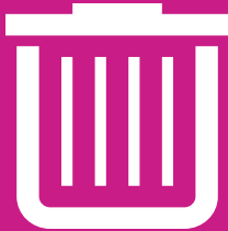
trash & kitchen