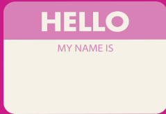
participant name badges