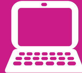
input thank you information